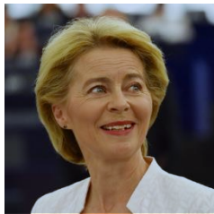
Ursula von der Leyen

The joint European Roadmap towards lifting COVID-19 containment measures, presented by the President of the European Commission and the President of the European Council, responds to the European Council Members' call for an exit strategy that is coordinated with Member States and that will prepare the ground for a comprehensive recovery plan and unprecedented investment.